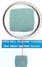
OPEN CELL SILICONE PADDING Best Steam and Best Vacuum!